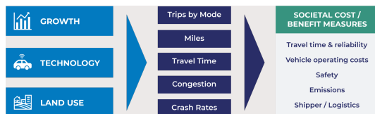
HRTPO Economic Analysis